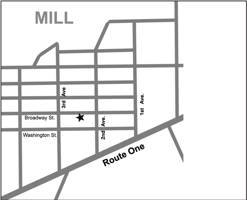
Zone 5 Meeting Location - Baileyville Town Office

Eastern Maine Electric Co-op is a not-for-profit, consumer-owned electric utility, with a consumer-elected Board of Directors. A director is elected from each of eleven zones at a Zone Meeting held every three years. This year, your zone will hold its Zone Meeting and board election.